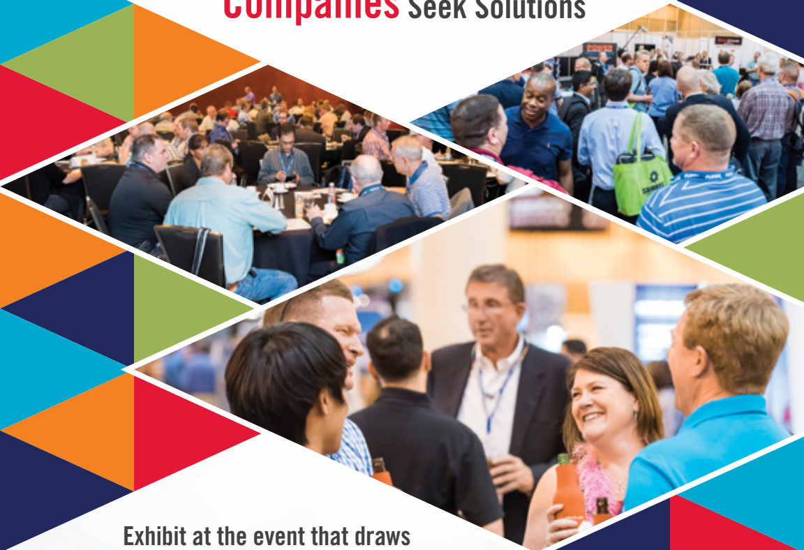
Exhibit at the event that draws more power generators than any other

Where Generating Companies Seek Solutions